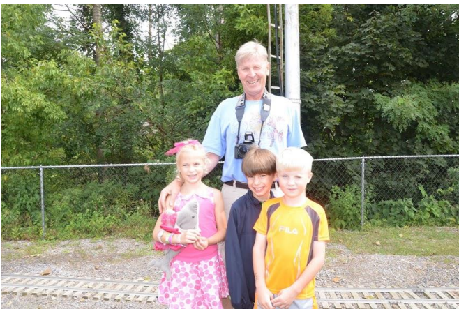
One of our faithful VIP families each week.