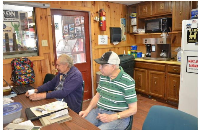
Listening intently. Must be a good story.