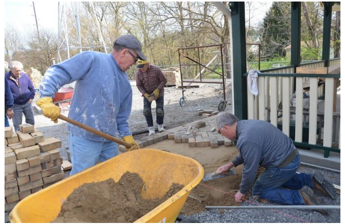
Laying a beautiful walkway isn't easy work.