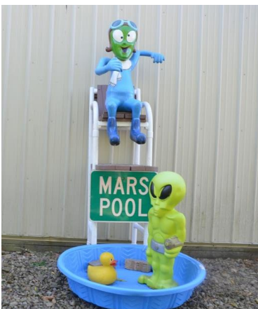
The kids on the train really love this historical donation.