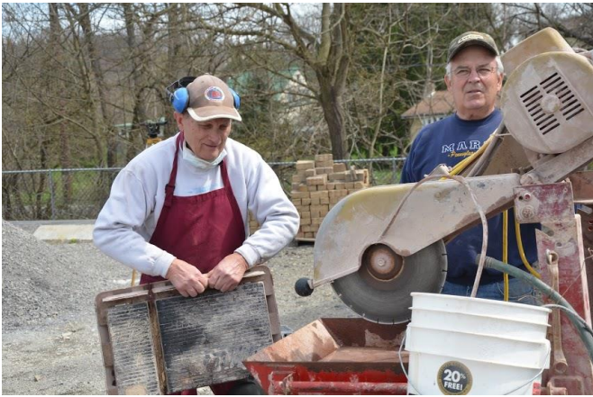
Precision cutting of brick for the walkway.