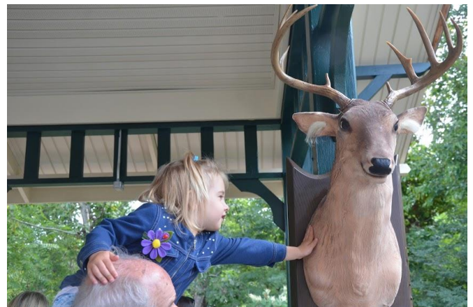
Wait Pap, this deer just said something to me!